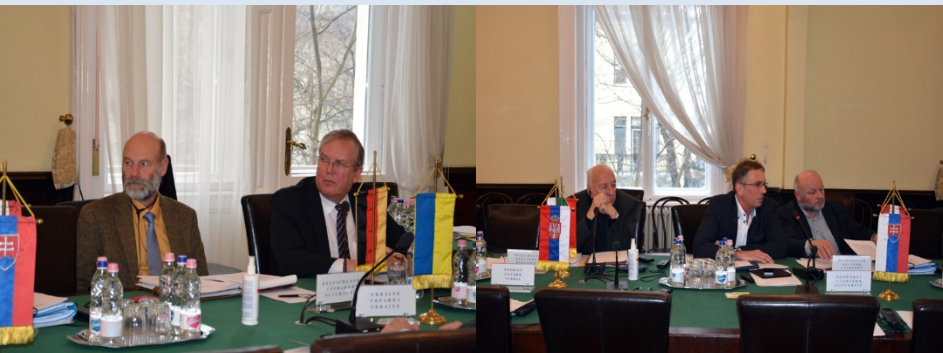
1st DC's EG ON SECURITY MATTERS (15 February 2017)