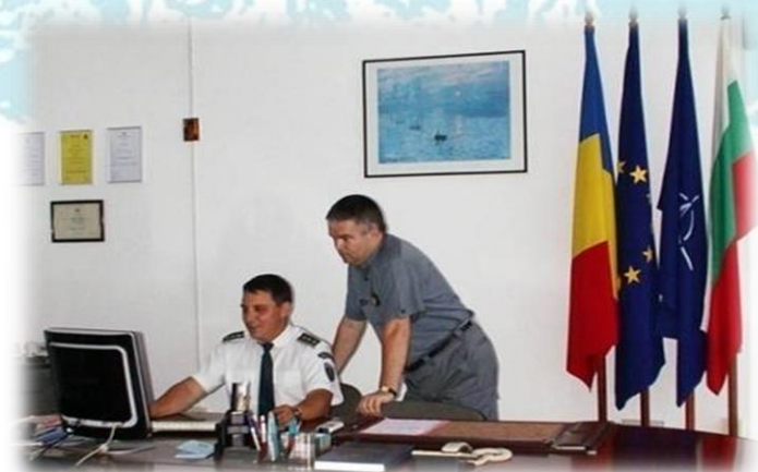
EU legislation inland navigation, Strasbourg 12102017