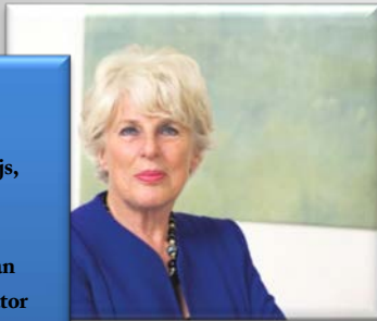
Cabinet of Com.